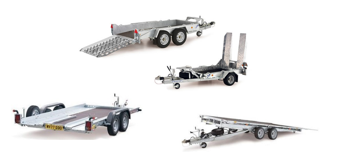
All prices are in £ and exclusive of VAT